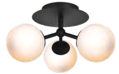
ATOM TRIO OPAL Art. 740154

Size: Ø26, H16 cm Material: Glass Ø10 cm, metal Color: Smoke, black Socket: 3 x G9, Max 28W excl.