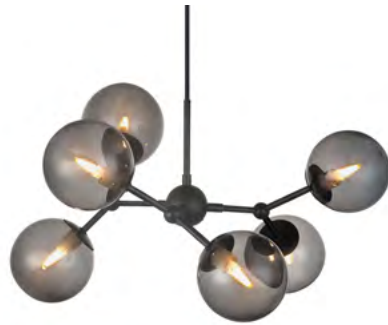
ATOM PENDANT Ø57 SMOKE Art. 738823

Size: Ø45 cm, H17,5 cm Material: Glass Ø10 cm, metal Color: Smoke, black Socket: 6 x G9, Max 28W excl.