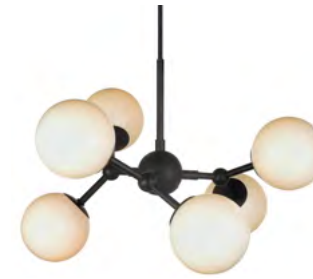
ATOM PENDANT Ø45 OPAL Art. 736546

Size: Ø57 cm, H28 cm Material: Glass Ø12,5 cm, metal Color: Smoke, black Socket: 6 x G9, Max 28W excl.