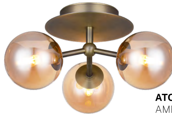
ATOM TRIO AMBER Art. 740178

Size: Ø26, H16 cm Material: Glass Ø10 cm, metal Color: Opal, black Socket: 3 x G9, Max 28W excl.