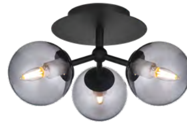
ATOM TRIO SMOKE Art. 740161

Size: Ø26, H16 cm Material: Glass Ø10 cm, metal Color: Smoke, black Socket: 3 x G9, Max 28W excl.