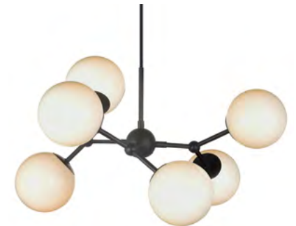
ATOM PENDANT Ø57 OPAL Art. 738816

Size: Ø45 cm, H17,5 cm Material: Glass Ø10 cm, metal Color: Opal, black Socket: 6 x G9, Max 28W excl.