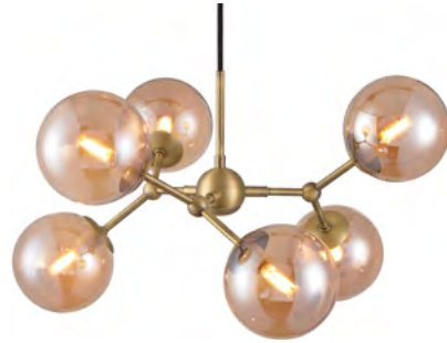
ATOM PENDANT Ø57 AMBER Art. 738830

Size: Ø45 cm, H17,5 cm Material: Glass Ø10 cm, metal Color: Amber, antique brass Socket: 6 x G9, Max 28W excl.