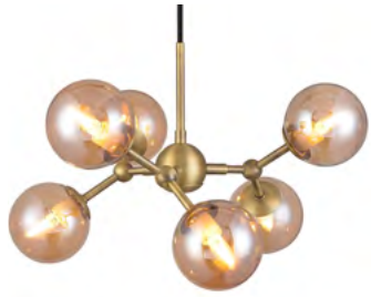
ATOM PENDANT Ø45 AMBER Art. 736560

Size: Ø45 cm, H17,5 cm Material: Glass Ø10 cm, metal Color: Amber, antique brass Socket: 6 x G9, Max 28W excl.