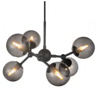
ATOM PENDANT Ø45 SMOKE Art. 736553

Size: Ø45 cm, H17,5 cm Material: Glass Ø10 cm, metal Color: Smoke, black Socket: 6 x G9, Max 28W excl.