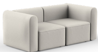
A2H | 184 x 92 cm