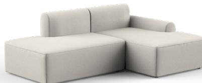
E2L | 217 x 147 cm