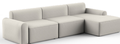
D6L | 298 x 147 cm