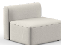
97E | 92 x 92 cm