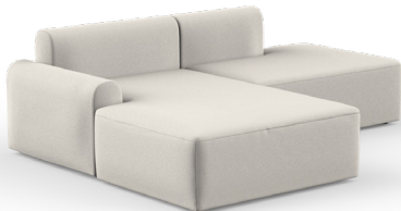
E3L | 239 x 182 cm