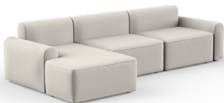
D5L | 298 x 147 cm