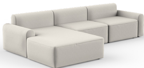
D3L | 320 x 182 cm