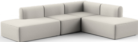
F2H | 287 x 217 cm