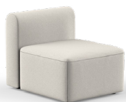
77E | 70 x 92 cm